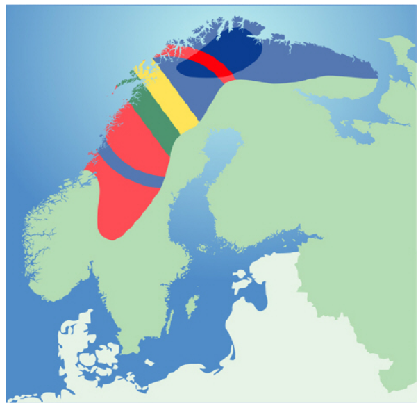
Figure 1. Sápmi covers part of four countries according to the Norwegian Sámi parliament

The Sámi rights commission admits only that probably the core area of the Finnmark plateau must be considered as belonging to the Sámi according to this paragraph. The arguments of the Sámi parliament are neither very clear nor consistent. Sometimes it sounds as if more than half of Norway and the Barents Sea must be considered to be lands they traditionally have used and depended on.